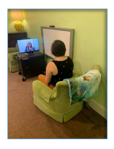
(Pictured left) Teleforensic Interview set up. (Pictured right) Therapist utilizing telehealth.